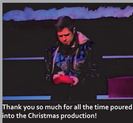
Thank you so much for all the time poured into the Christmas production!

Thank you so much for the donation of Gideon Bibles in my mother's name. Thank you for the prayers and cards, phone calls and visits to the family during her illness. Knowing that our church family and many, many others were praying for God's comfort and peace during this difficult time was an amazing blessing to us. Again, thank you for showing God's love.